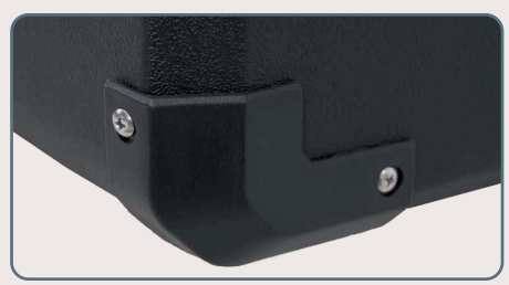
Protective foot pad