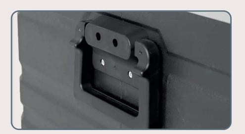
Heavy duty handle